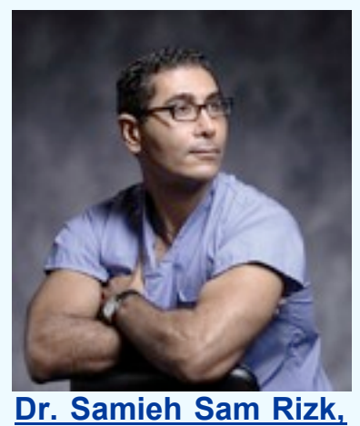
M.D., F.A.C.S. <u>Director, Manhattan</u> <u>Facial Plastic Surgery</u>